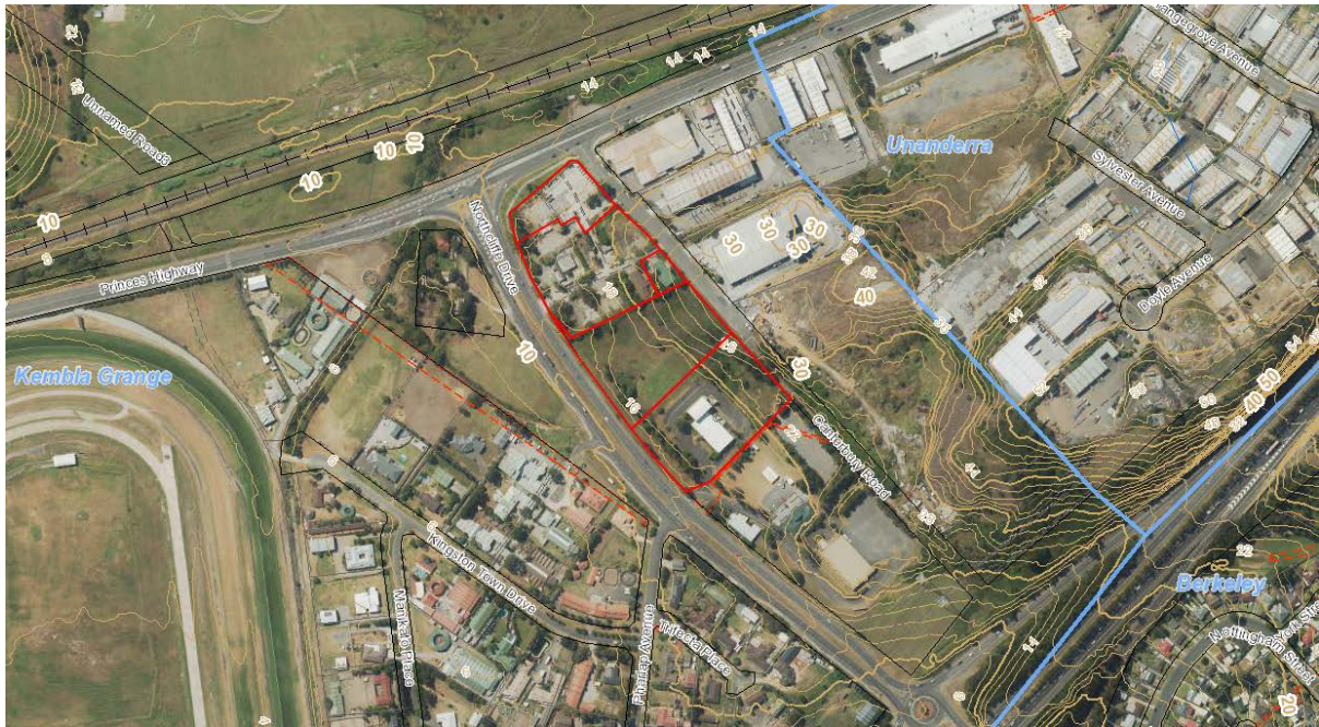
2016 Aerial photograph